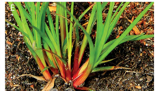
A- habitat, B- whole plant, C- flower heads, D- capsules and tepals, E- leaves reddish colour at base.