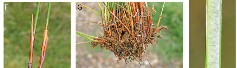
A- habitat, B- whole plant, C- flower head of J. effusus var. effusus , D- flower head of J. effusus var. compactus , E- continuous pith, F- basal sheath, G- base of plant.