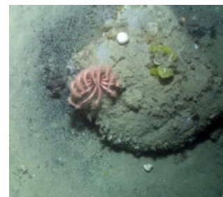
DTIS image of ocean floor and deep-sea invertebrates

The 2020 voyage has continued to use in situ observations, to provide information on the concentrations and distances over which impacts of suspended sediment on faunal communities become 'ecologically significant'.