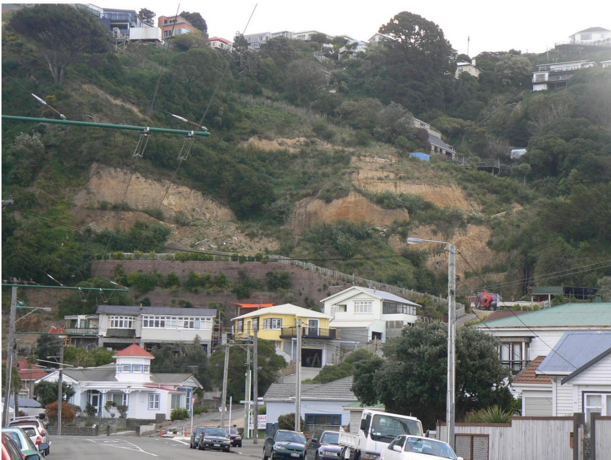
Figure 4.1: Case study site, Wellington.

This section outlines the process of applying the Top-down Decision Tool. It then discusses the outcome in practice, possible lessons learnt and the next steps that are likely to occur.