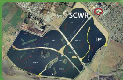
Oxidation ponds showing SCWR location.

Solray Energy has built, and is operating, a revolutionary processing plant to convert algal biomass to a renewable bio-crude oil that is a replacement for fossil fuels. After harvesting from NIWA's demonstration High Rate Algal Pond system, the algae are subjected to high temperature and pressure in Solray's Super Critical Water Reactor (SCWR). The reactor has been designed to continuously process between 4 – 40 m 3 of harvested algal biomass per day, depending on the water content (1 – 30% solids).