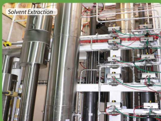
Solvent is used to strip the bio-crude oil out of the algae residue. The solvent is recycled and the algal residue used as fertilizer.