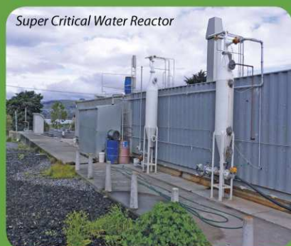
The Super Critical Water Reactor mimics processes that produced fossil oil. Intense heat (above 300 °C) and pressure (above 20 MPa) are used to convert algal biomass to bio-crude oil.

This joint Solray, NIWA and CCC project will determine the energy efficiency and economics of conversion, extraction and refining of algal bio-crude oil at large-scale. The key steps in the process are illustrated below: