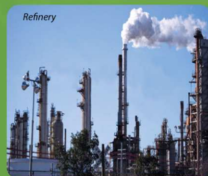
The bio-crude oil is separated into useful fractions such as petrol (20%), diesel (45%) and bitumen (20%). Other useful products include CNG, LPG, and waxes.