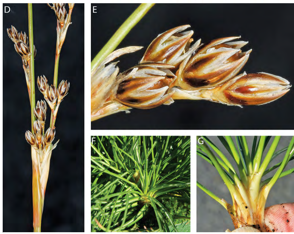
A- habitat, B- whole plants often with dead foliage present, C- whole plant showing flower head, D- flower head, E-capsules and tepals, F- leaves, G- base of leaves.