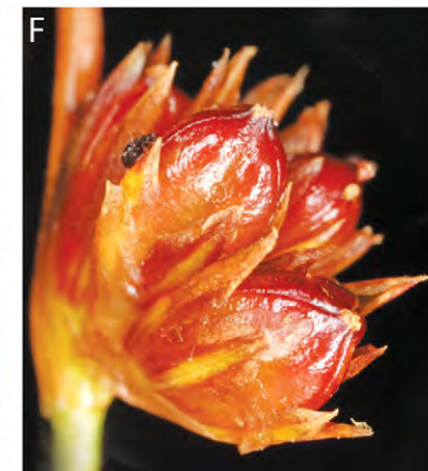
A- habitat, B- whole plants, C- whole plant showing position of flowers with leaves growing much longer than the stem, D- note small size of plant next to thumb nail, E- flower heads, F- capsules and tepals, G- leaves with internally visible cross walls.