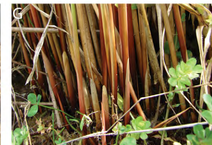
A- habitat, B- whole plant, C&D- flower heads, E- stems, F- capsules and tepals, G- basal sheaths.