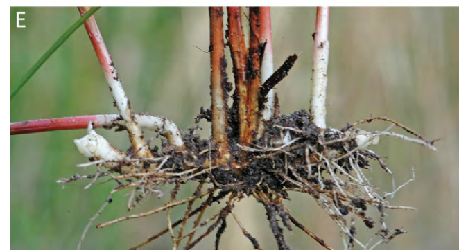
A- herbarium specimen, B- flower heads, C- stems, D- leaves with visible cross walls, E- creeping rhizome. (Photo A supplied by Allan Herbarium, CHR copyright, Landcare Research. Images B, C, E and that used for the title banner supplied by Larry Allain, USGS, Wetland and Aquatic Research Center, USA).