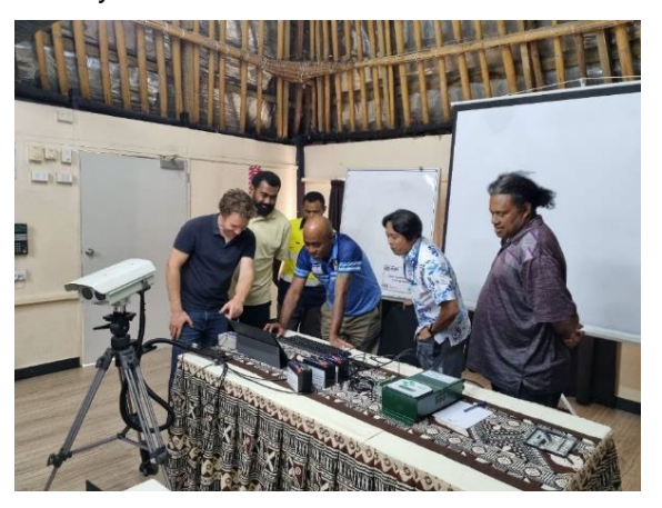
Stereoscopic camera station installation - Narara Village.