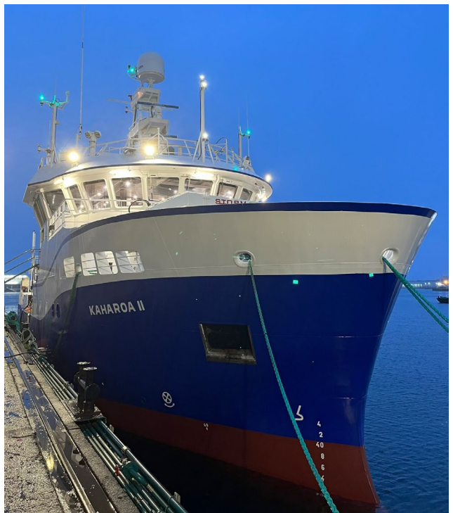
RV Kaharoa II at the shipyard in Vigo, Spain.

The build of RV Kaharoa II was essentially completed during the quarter and sea trials of the vessel will commence in January. The planned date for delivery of the vessel to NIWA is 1 March, and the vessel will leave Vigo and sail to New Zealand via the Panama Canal shortly afterwards. The vessel has been built to the challenging specifications required by NIWA and within budget.