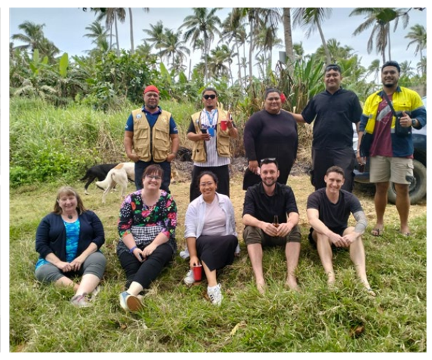
[Left] Workshop participants at the Tonga-NZ Hunga volcano impacts stakeholder workshop; [Right] Joint incountry mission team comprising NIWA, Tonga Geological Services, GNS Science, University of Canterbury and Massey University.