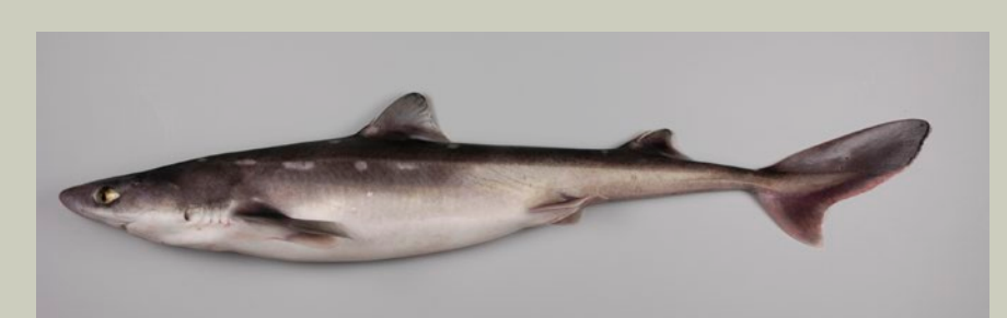
Spiny dogfish (Squalus acanthias)