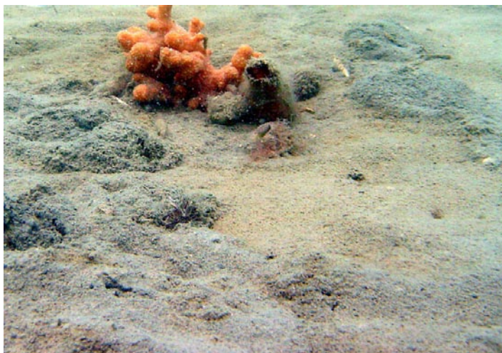
A coastal soft-sediment habitat at 6 m depth, in Mahurangi Harbour, north of Auckland. Sponges, tunicates, bivalves, crustaceans, worms, and burrowing urchins (shown bulldozing through surface sediment layers) contribute to the great biodiversity and biocomplexity of soft-bottom seafloors.

Although the sophistication of techniques used to measure fluxes has increased dramatically in recent years, the interpretation of flux data is still quite complicated, for many reasons. Soft sediments are inherently complex: bacteria, microalgae, and benthic invertebrates all influence oxygen and nutrient concentrations simultaneously, via direct and indirect pathways (see diagram, right). Fluxes are net results of all such interactions, some of which reinforce each other to increase or decrease flux, and some of which oppose each other. It takes a collaborative, interdisciplinary approach to understand the physical, geochemical, and ecological fac-