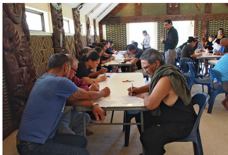
Workshop to develop a shared vision for the marae.

The top five priorities for each category formed a key component of the marae-opoly game (Step 4) and provided a guide and reference for developing and evaluating possible pathways.