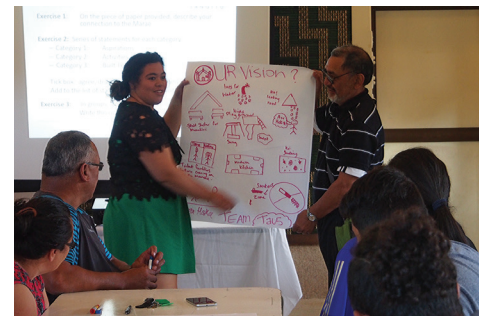
Presenting a vision for the marae back to the whā at Hui-ā-Hapū.

Find resources and more information at www.niwa.co.nz/te-kuwaha/tools-and-resources