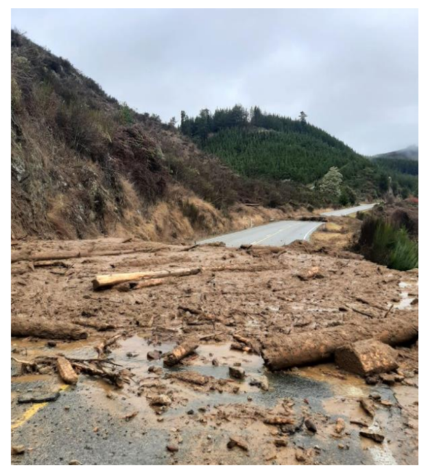
Photo 2: Slips and debris on the road in the Tasman region after heavy rain on 25 July.

The following weekend, another heavy rainfall event hit the top of the South Island, with Motueka recording an additional 88 mm in a 48-hour period. Tākaka Hill Road was closed due to a large slip, and several other roads were closed due to flooding.