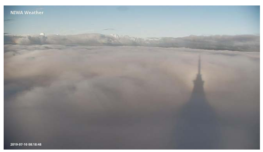
Foggy morning in Auckland on 10 July

On 10 July, sea fog caused several delays and cancellations to and from Auckland Airport and caused disruption for travellers. Sea fog is formed when moist air moves over cooler water. A low level northwest wind flow transported the fog in over the city.