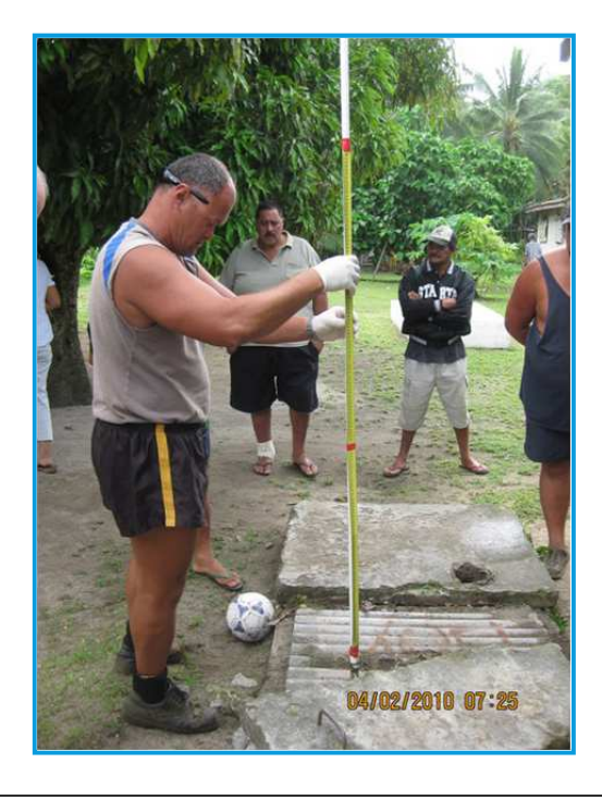
Photo 3. Probing septic tank first chamber for scum and sludge depth.