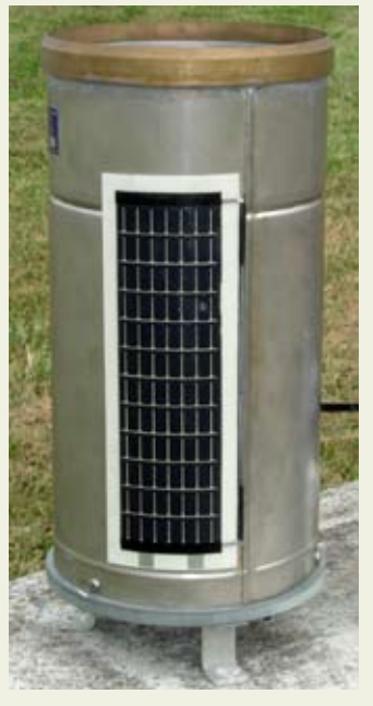
NIWA's upgraded Rain Intensity Gauge showing the new flexible 'wrap around' solar panel.

The new RIG is fully telemetered using Unidata NEON (Crossramp) technology using either the GPRS or CDMA cellular networks. This allows the hourly reporting of rainfall data with rain intensity data recorded every 6 seconds during rain events. A flexible solar panel on the housing provides power for the sensor and communications and charges the internal battery. As a result, the gauge no longer requires regular site visits for data collection and battery replacement. Five units are currently being commissioned for use within the NIWA Climate Network.