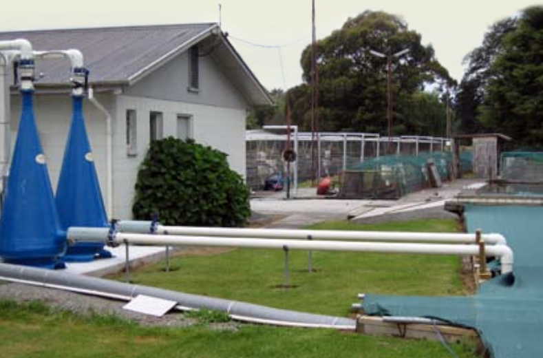
Water from a nearby stream is pumped into the large blue cone-shaped towers called diffusers (right) where oxygen is added if required. The oxygenated water is then piped into the raceway.

NIWA's Silverstream hatchery, north of Christchurch, mainly rears Chinook salmon for supply to commercial fish farms. The hatchery gets its water from a nearby stream. During early morning in summer the water may not contain enough dissolved oxygen due to the respiration demand of aquatic plants in the stream. This can be fatal for the salmon.