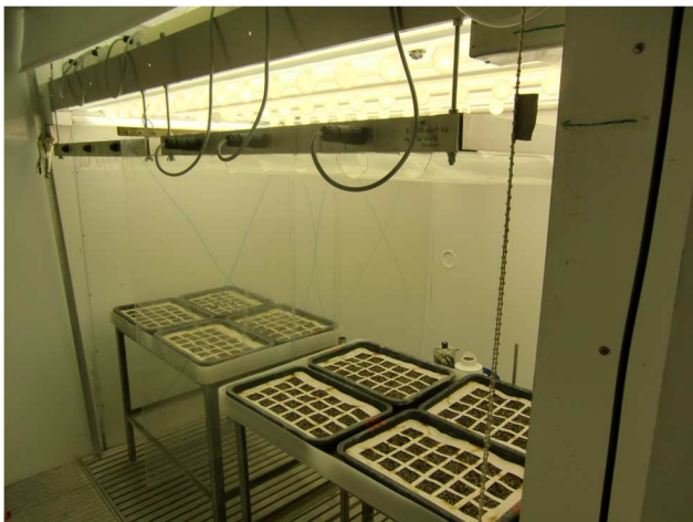
Figure 1. Exposure of plants to UV-B radiation under controlled environment conditions.

Research on UV effects in plants is entering its fifth decade. Initial studies were triggered by the realisation that the stratospheric ozone layer was becoming depleted. Consequently, most studies in plants focussed on the damaging effects of UV, and particularly of UV-B radiation. The large majority of these studies were conducted under indoor conditions, and often paired with low levels of accompanying photosynthetic photon flux (PPF, ~400-700nm). The latter has photo-protective effects, e.g. strongly contributing to photorepair of UV damage in plants. The frequently applied high and unrealistic UV-B/PPF ratios in those earlier studies exaggerated UV effects in plants.